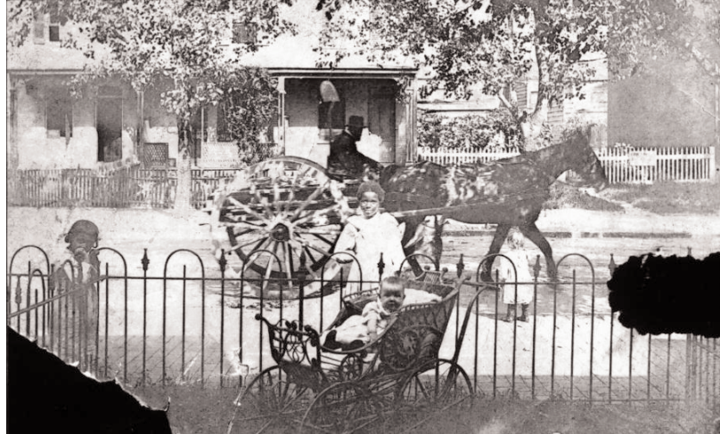
Cunningham House, Washington, DC c.1902