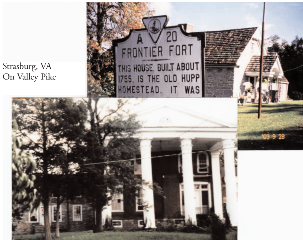
Strasburg, VA On Valley Pike

So, this is just an illustration of what most of the “Eastern Knees” did or the ones who did not go to Darke County, Ohio