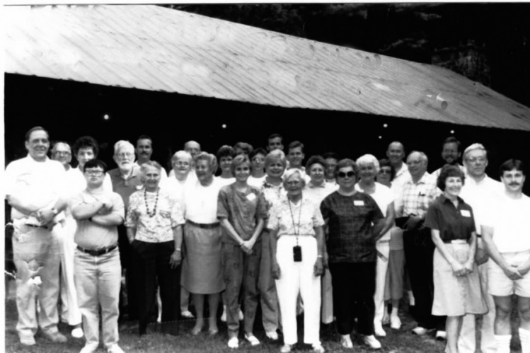
Knee Family Reunion July 1990 - Wardensville, West Virginia