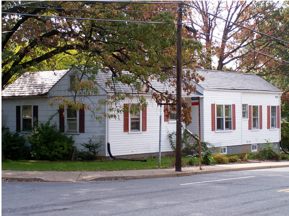
Pan's House 2700 N. Pershing Drive - Arlington, VA Reconstructed c 1964