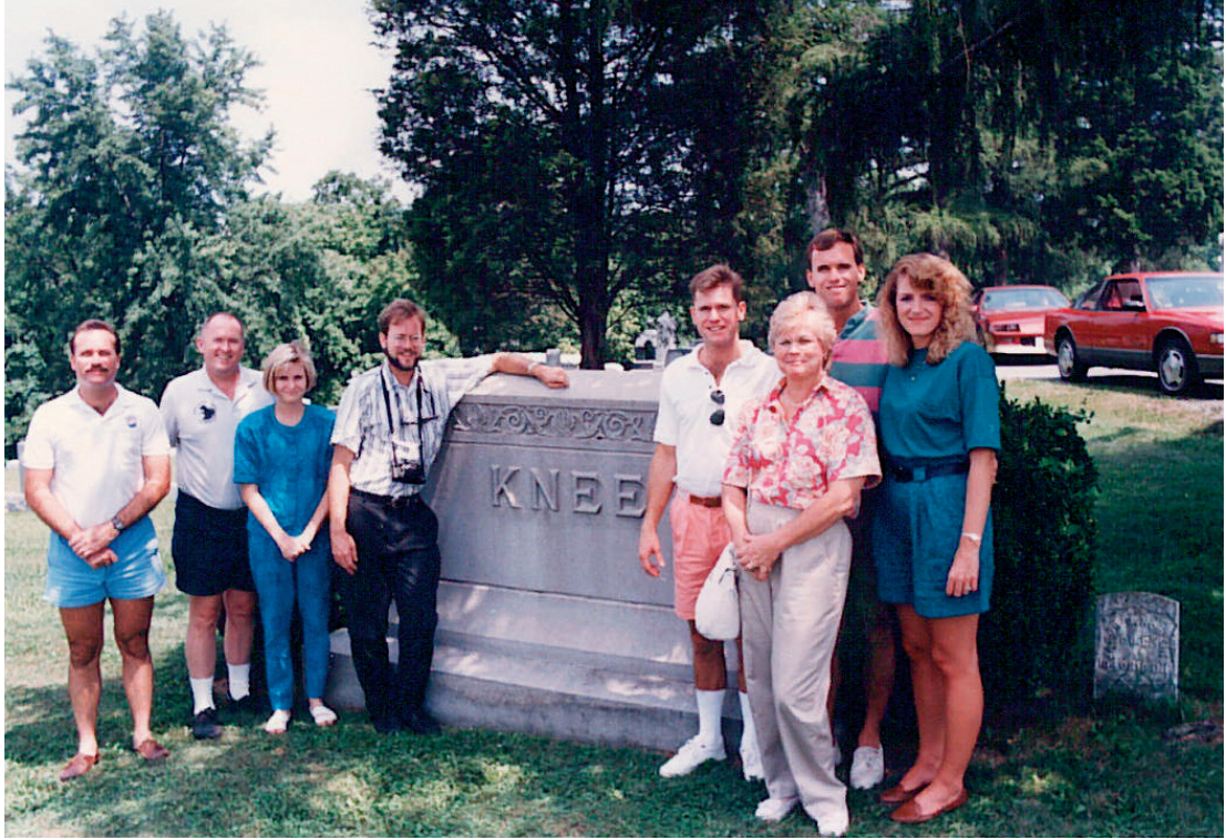
Riverview Cemetery - Strasburg, VA 1990