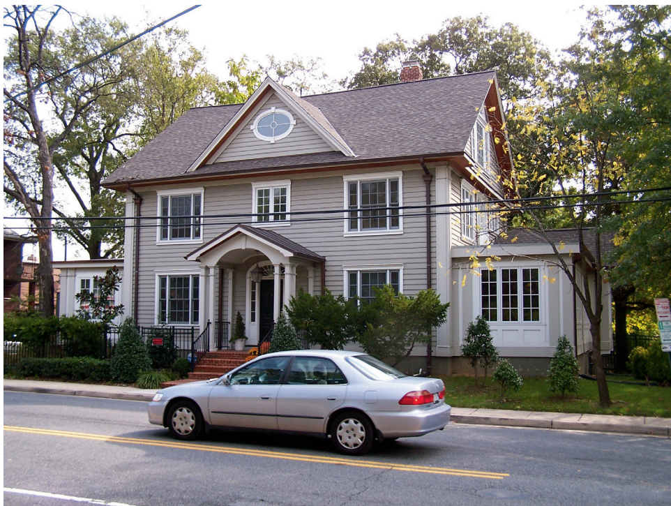
2730 N. Pershing Drive - Arlington, VA