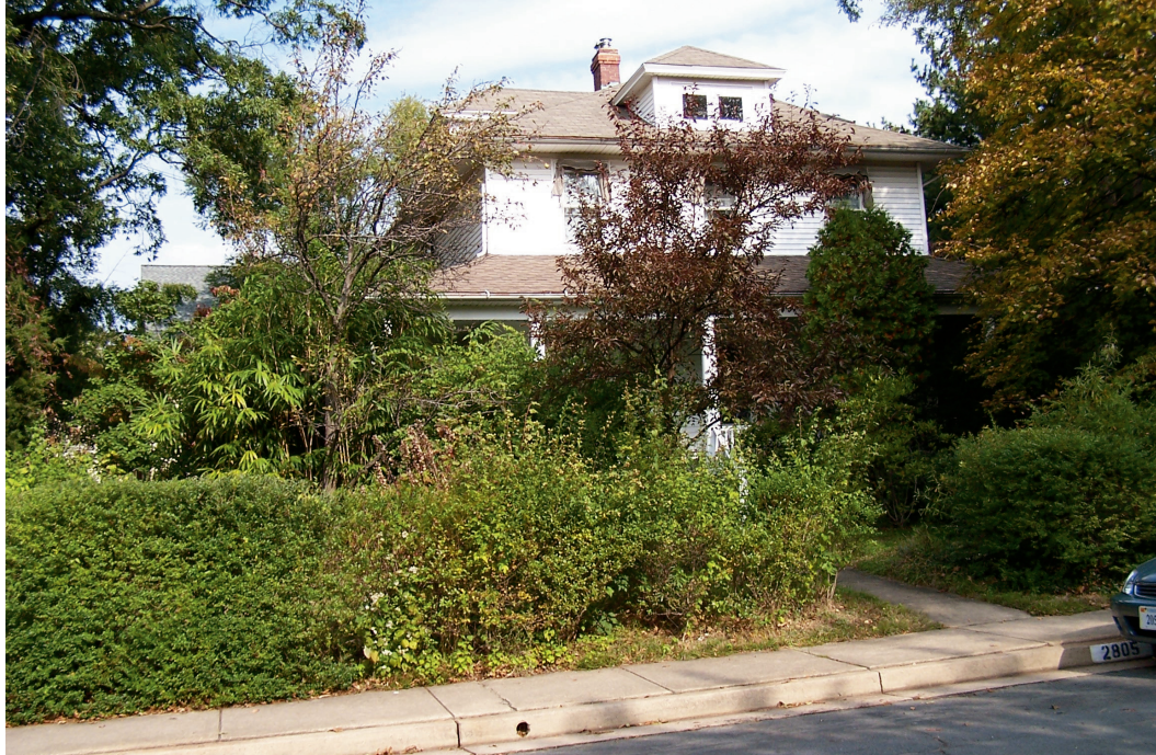
Mooney House 70 Edgewood

mortgage until they could pay it off a few years later. She was said by my mother to have had flaming red hair and to this day we value a cream pitcher she carried from Ireland as her only possession which was filled with butter for her contribution to food in the steerage area of the ship bringing her over. Like the early Knees, determined people coming over to make a better life.