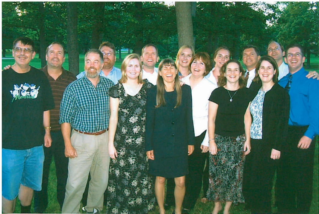
Karcher descendants June 2004